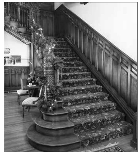
The festive decorations were one of the highlights of the Peirce Mansion's annual Holiday Open House, a free event for the community.

library ceiling repair, as well as plumbing and air conditioning repairs.