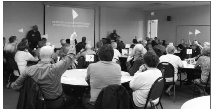
The teams raised their flags to answer the Trivia Night questions.

The annual volunteer dinner featured the third Trivia Night, this time with volunteers moving to different tables to interact and form a team with other volunteers.