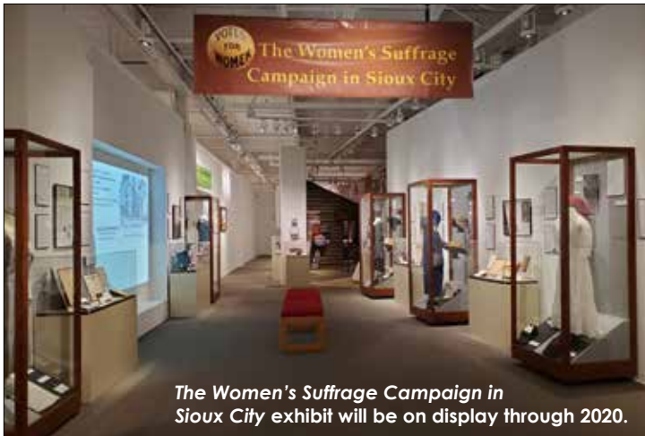
The Women's Suffrage Campaign in Sioux City exhibit will be on display through 2020.

In commemoration of the 100th anniversary of the passage of the 19th Amendment in 1920, The Women's Suffrage Campaign in Sioux City exhibit will be on display through 2020 at the Sioux City Public Museum. The exhibit features historic photographs, period clothing, and artifacts relating to local suffragists, women's clubs and political figures of the era.