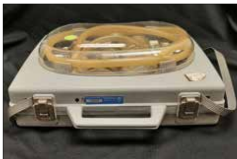
A 1969 portable aspirator used at Marian Health Center.