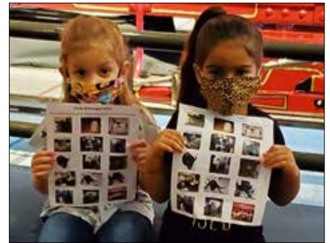
The first fall Kid's Days featured a farm-themed scavenger hunt in September 2020.

Museum staff also continued to reach school groups by presenting 25 virtual tours and presentations to K-12 students during FY21, totaling