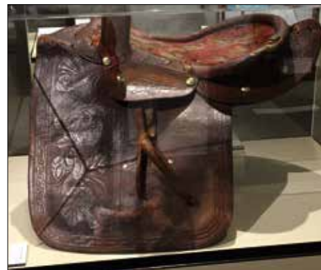
The side saddle used by Carolyn "Tigger" Jensen's grandmother, Florence Slagle, shown in a display case from the New to You: Recent Artifact Donations exhibit.