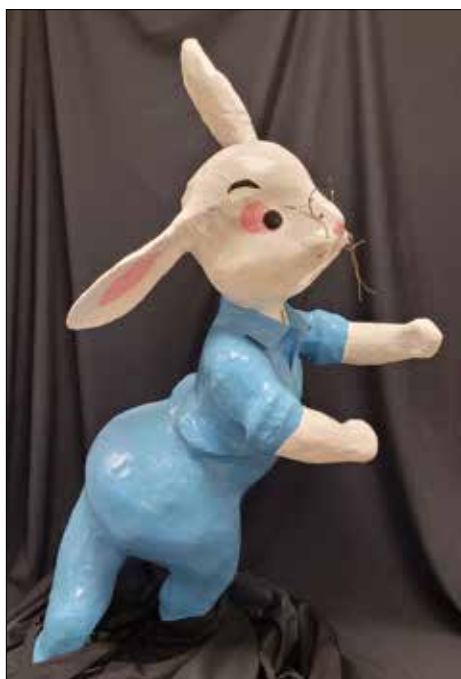
"Harvey the Rabbit," a paper mache Easter Bunny from Younker-Davidson's, was showcased in the FY21 temporary exhibit, New to You: Recent Artifact Donations .