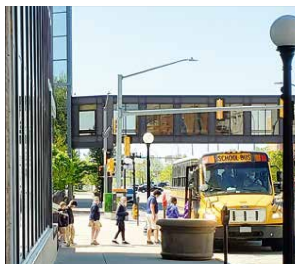
In October 2020, the first school group returned to the Museum since the start of the pandemic. However, many schools opted for virtual tours for most of the fiscal year.

I thank everyone for your support and wish you a healthy and peaceful holiday season and a new year full of blessings.