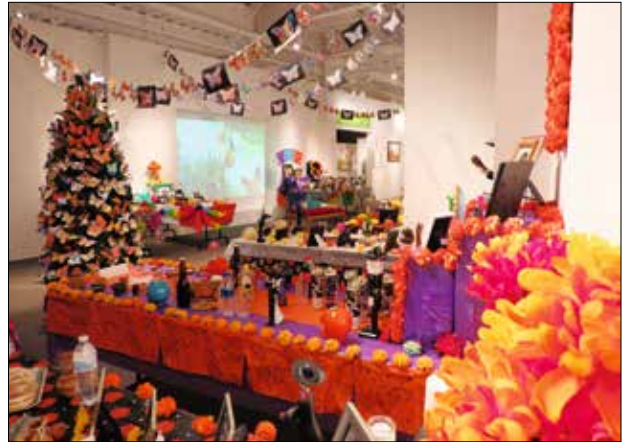
The Monarchs, Midwest and Michoacán – Coming Home altar display exhibit featured a pine-tree habitat with monarchs decorated by local schools and the community.

Offered in both English and Spanish, Día de los Muertos programs began in September to coincide with the migration of the monarch. A program featuring the children's book, "Señorita Mariposa," traced the monarch's great journey through the Midwest and Michoacán. Participants were encouraged to make a monarch to help decorate the altar display exhibition. Along with monarch-making programs, an altar-making